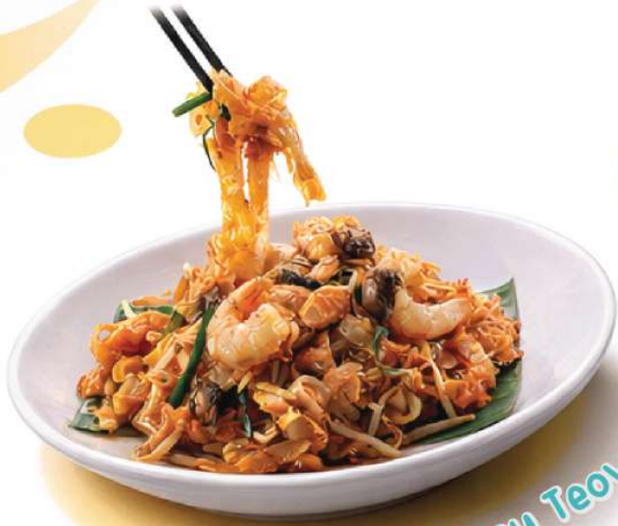
Penang Char Kuey Teow