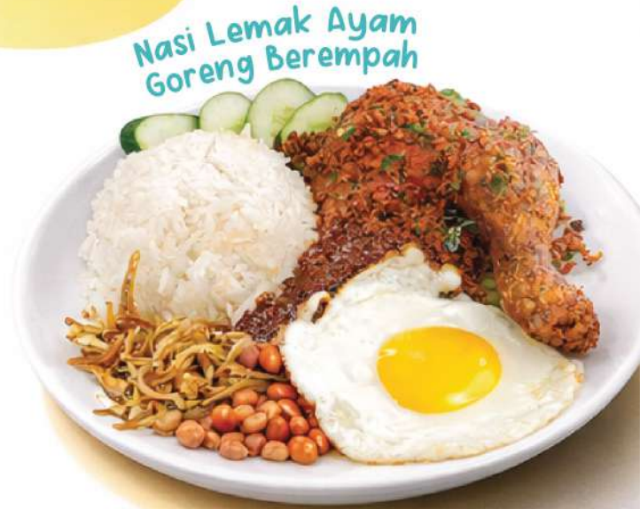
Nasi Lemak Ayam Goreng Berempah